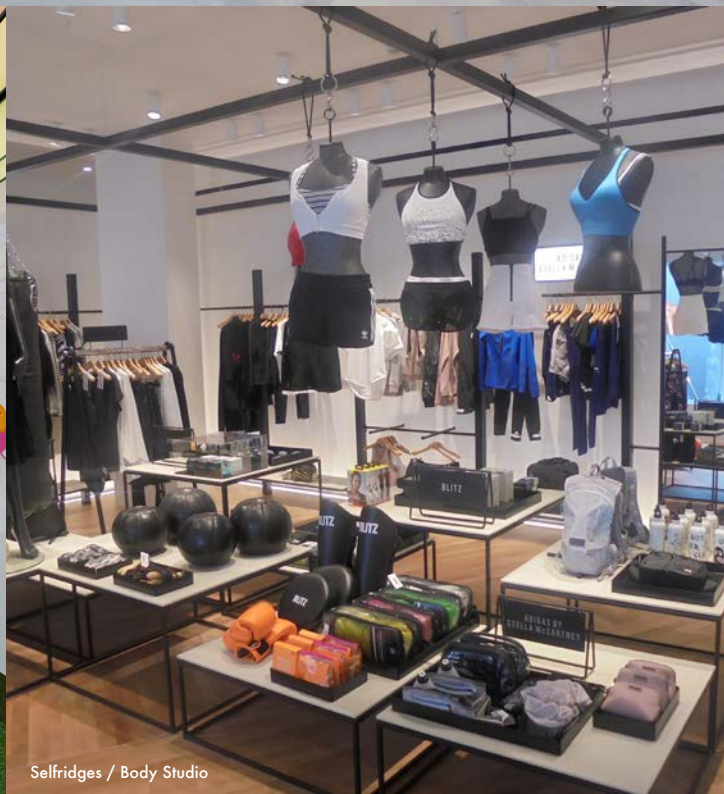
Selfridges / Body Studio