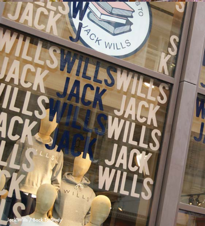
Jack Wills / Back To Study