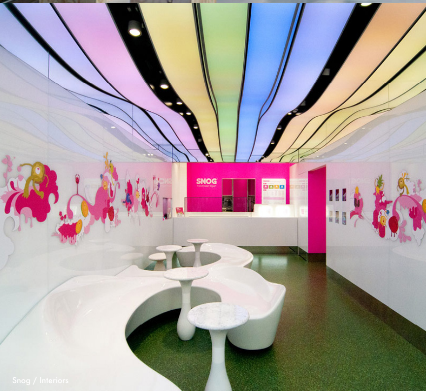
Snog / Interiors