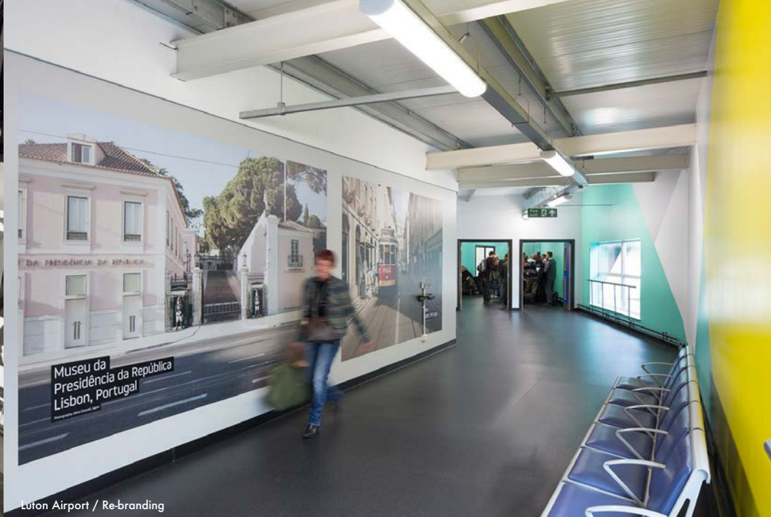
Luton Airport / Re-branding