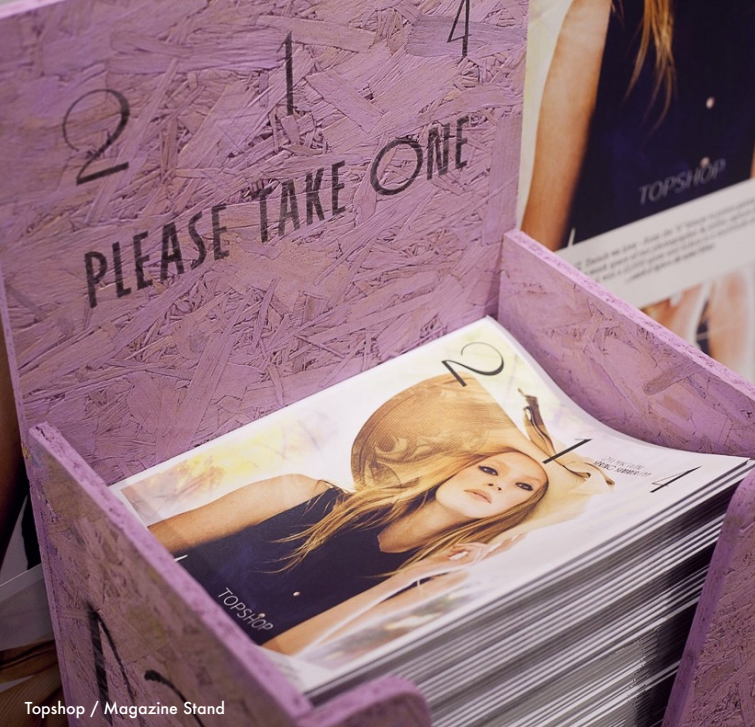
Topshop / Magazine Stand