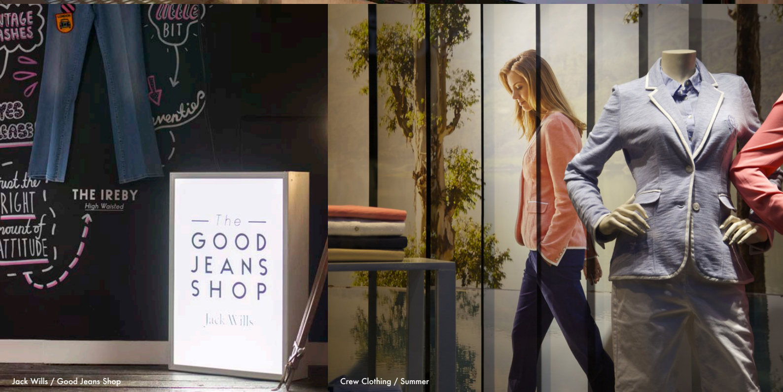
Jack Wills / Good Jeans Shop