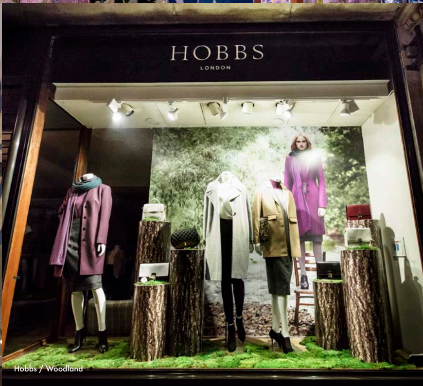
Hobbs / Woodland