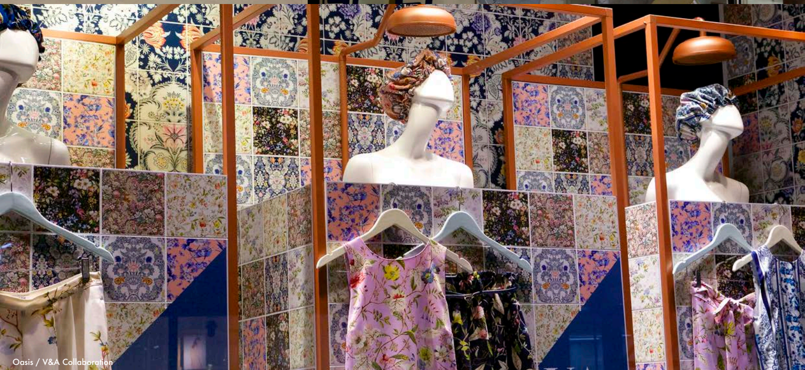
Oasis / V&A Collaboration