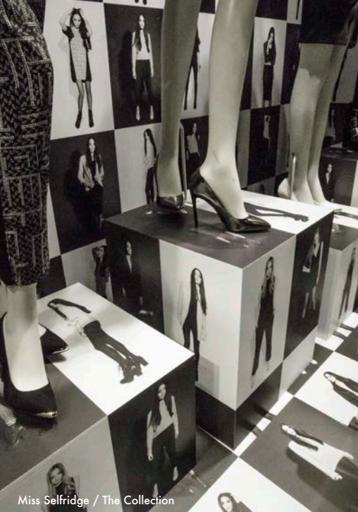
Miss Selfridge / The Collection