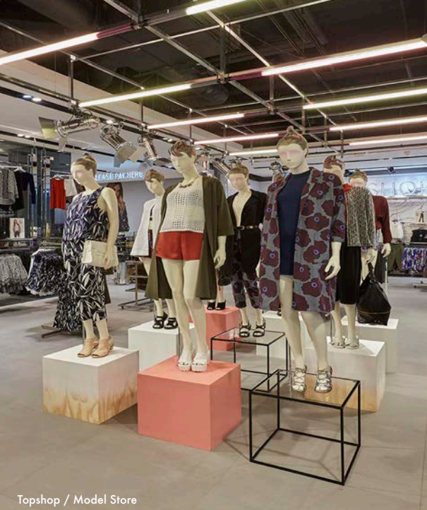
Topshop / Model Store