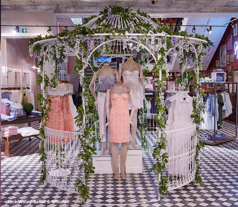
Jack Wills / Belles & Whistles