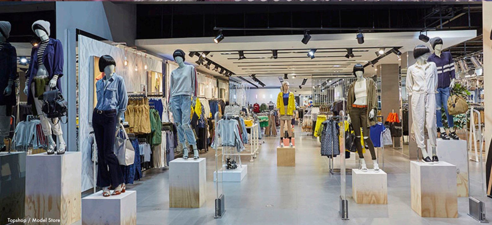
Topshop / Model Store