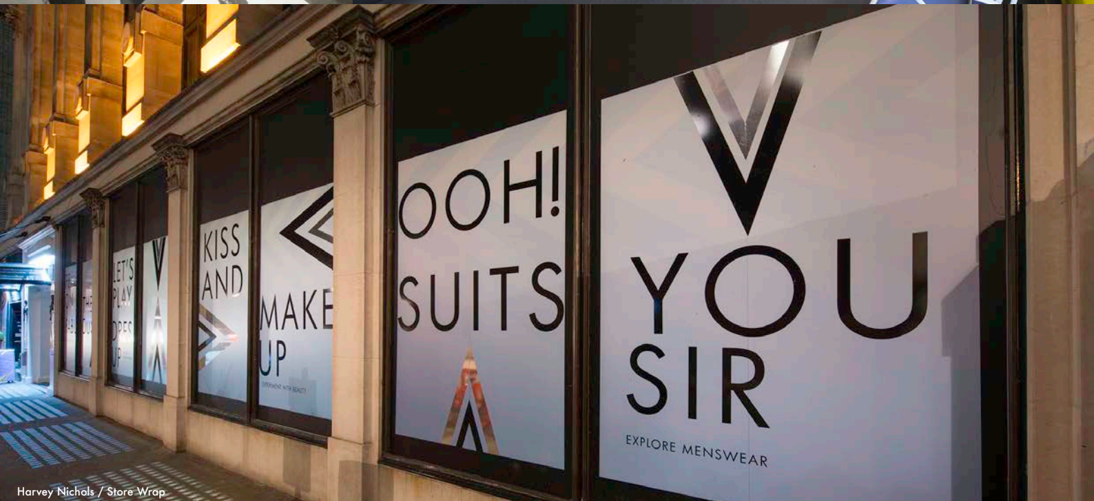
Harvey Nichols / Store-Wrap